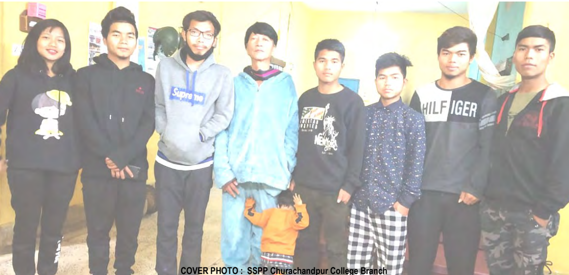
COVER PHOTO : SSPP Churachandpur College Branch

The Editor SIAMSIN JOURNAL SSPP Complex, Siloam Veng, Bungmual Lamka, Churachandpur, Manipur, India PIN 795006