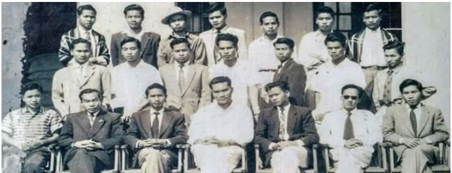
SIAMSINPAWLPI (Paite Students Association) College Section 1960, Imphal

Nu leh pa mawl milmel, summuhna gina leng neilou, muhtawm netawm phialphialte khawng lou ngal in a tate uh hon kaisak mawk lou uhi. Hiai in i dinmun hon niamsak a hikei a, tasamte a dia panpihtu diktak, a poimohte mah panpih kha i hihman un hihdik na i hi. I hihding mah hihkha i hi uh ka chi a, kisaktheihhuai ka sa mahmah hi. ( Sutzop ding... )